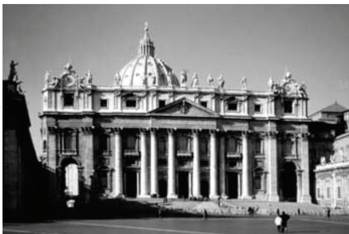
St. Peter's Basilica, where over 2500 bishops and theologians gathered for the opening session of Vatican Council II in 1962.