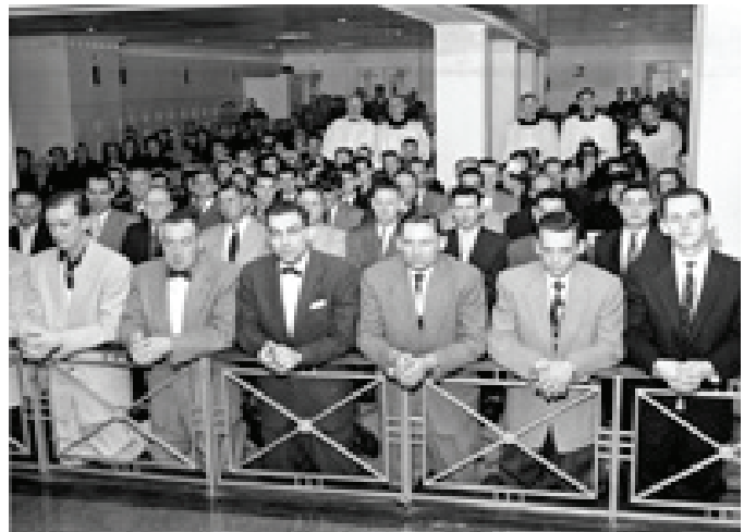
Catholic men gather at the communion rail during a Holy Name Society Mass, a monthly tradition in most Catholic parishes throughout the 1960s.